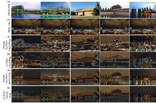
Fig. 4. Comparison with [1]

We compare our method with the state of the art method [1], which needs a time-lapse video captured by a fixed camera working for 24 hours. While our method needs only a single reference image. We randomly select 5 input images for comparison. As shown in Fig. 4, (a): multiple input images, (b) the reference image, (c): warped reference images to corresponding input images, (d): warped reference images using method of [1], note that they need a time-lapse video for warping, (e): the relit results using our proposed method, (f): the relit results using the method of [1]. The results reveal that our method can produce similar relit results as those of [1], with only a single reference image.