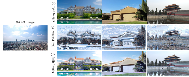
Fig. 3. The relit results of our method